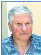
Robert S. Foosaner

The 2017 Wireless Hall of Fame inductees are: